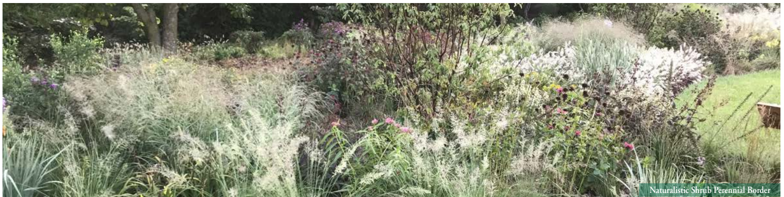
Naturalistic Shrub Perennial Border