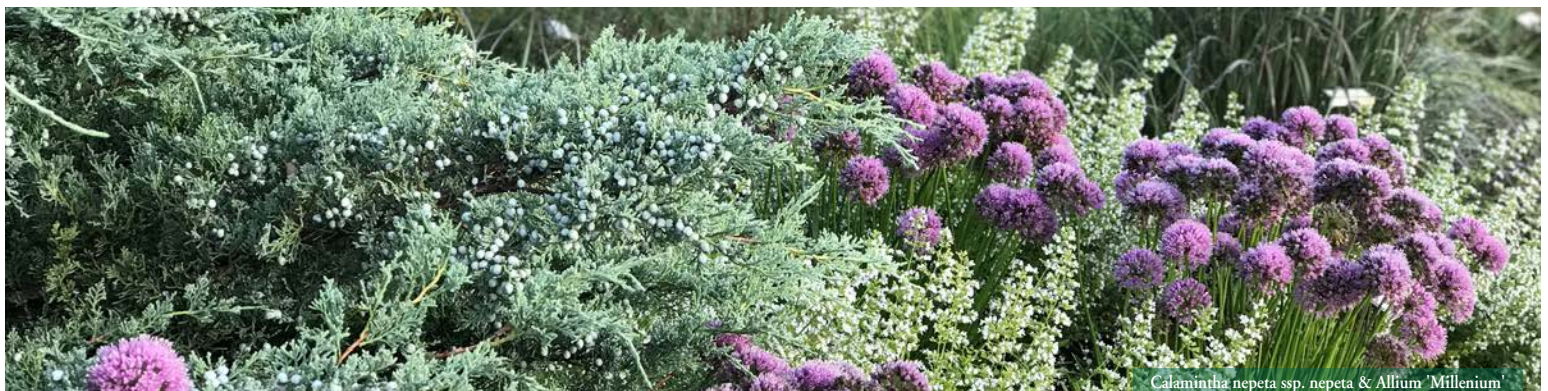
Calamintha nepeta ssp. nepeta & Allium 'Millenium'