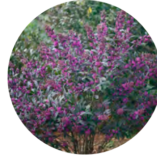
Callicarpa Pearl Glam®

Physocarpus Amber Jubilee™, Diervilla Kodiak® Red