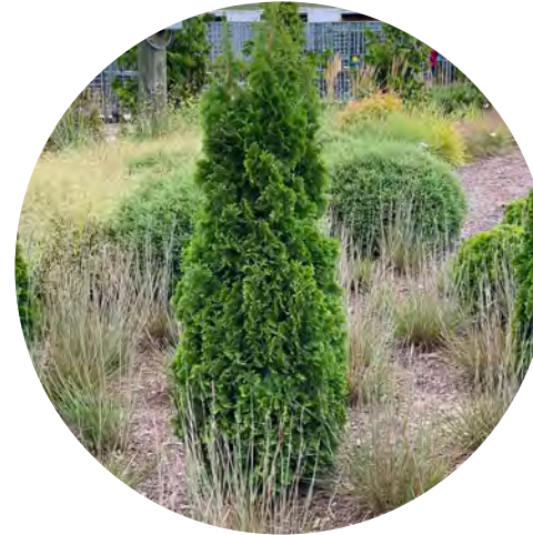
Thuja occid. 'Unicorn'