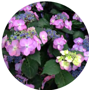
Hydrangea ser. Tuff Stuff™

Suggested Sub: Hydrangea Endless Summer Pop Star®