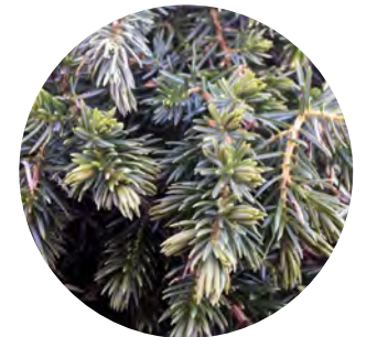
Juniper conferta 'Blue Pacific'