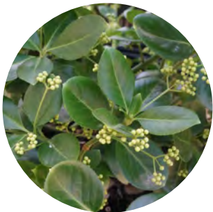
Euonymus 'Vegetus Low'

Suggested Subs: Upright Thuja, Juniper ssp.