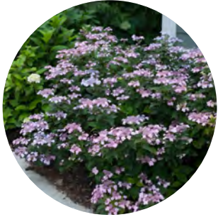
Hydrangea ser. Tiny Tuff Stuff™