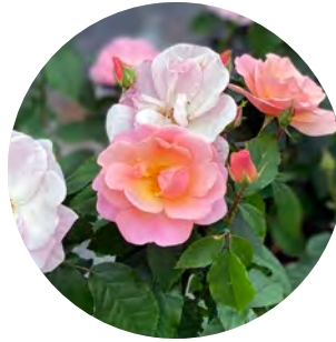
Rosa Knock Out® Peachy

Reason: Poor sales Suggested Sub: Rosa Easy Elegance® All the Rage