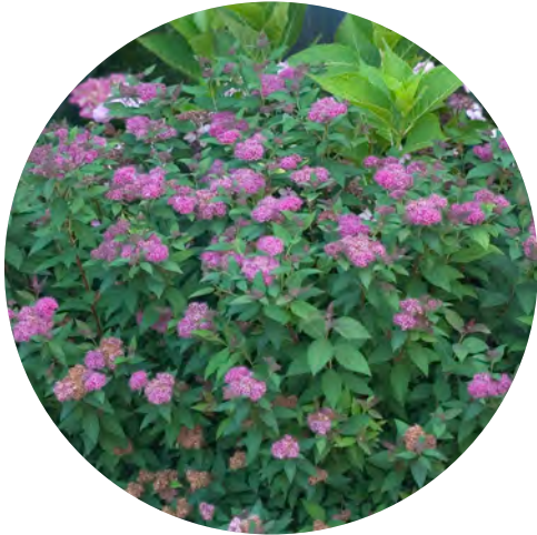
Spiraea Double Play® Artisan®