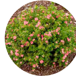
Potentilla Bella Bellissima®

Pinus mugo 'Slowmound', Thuja 'Linesville'