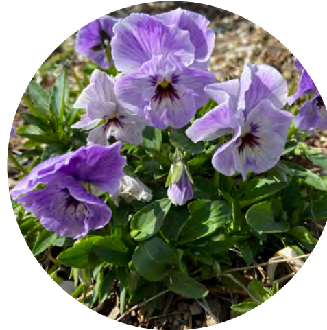
Viola 'Painted Porcelain'