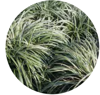
Carex morrowii 'Silver Sceptre'

Campanula 'Pearl Deep Blue', Isotoma fluviatilis