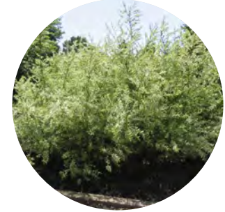
Salix integra 'Hakuro-nishiki'

Reason: Knock Out® dropping Suggested Sub: Rosa Knock Out® Easy Bee-zy™ - NEW25