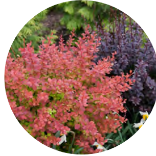
Berberis Sunjoy® Tangelo