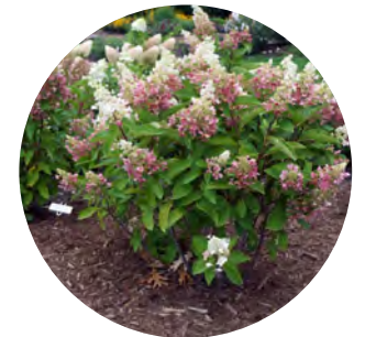
Hydrangea pan. Pinky Winky®

Suggested Sub: Hydrangea Little Quick Fire®