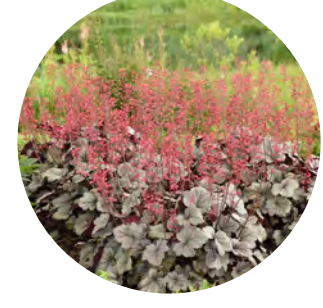
Heuchera Dolce® 'Silver Gumdrops'