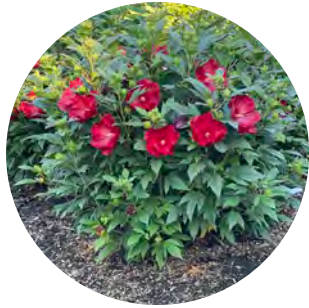
Hibiscus 'Cranberry Crush'