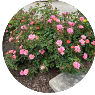
Rosa Easy Elegance® Sunrise Sunset

Reason: Consolidating Drift® line Suggested Sub: Rosa Pink Drift®