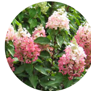
Hydrangea pan. Flare™

Suggested Sub: Spiraea Double Play Doozie®