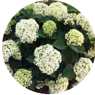
Hydrangea Invincibelle Limetta®

Reason: Did not perform as expected in the landscape