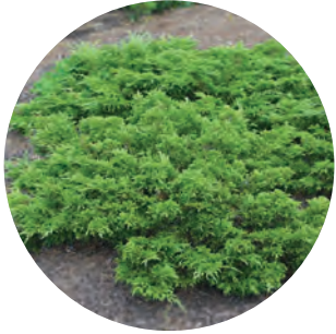
Juniper sabina 'Mini Arcadia'