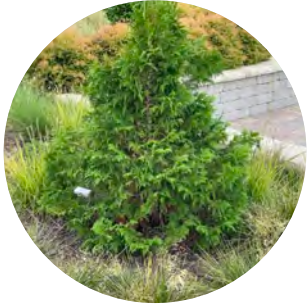
Chamaecyparis Soft Serve®