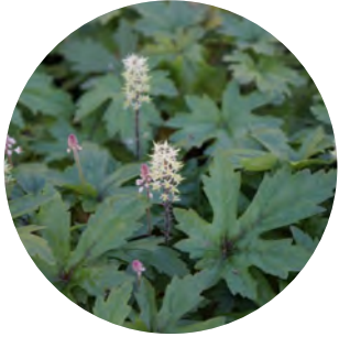
Tiarella 'Pink Skyrocket'

Reason: Replacing with Heucherella 'Pink Revolution' Suggested Sub: Heucherella 'Pink Revolution'