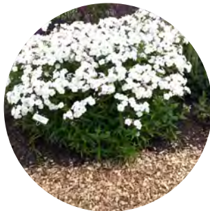
Phlox paniculata 'David'

Reason: Replacing with Heucherella 'Pink Revolution' Suggested Sub: Heucherella 'Pink Revolution'