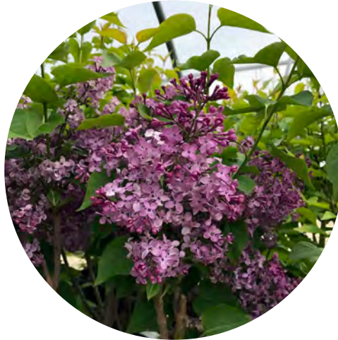
Syringa vulgaris 'Charles Joly'