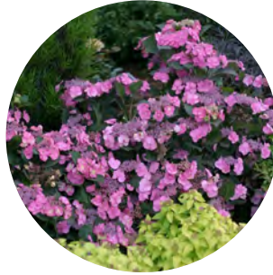
Hydrangea ser. Tuff Stuff™ Red

Suggested Sub: Hydrangea Endless Summer Pop Star®