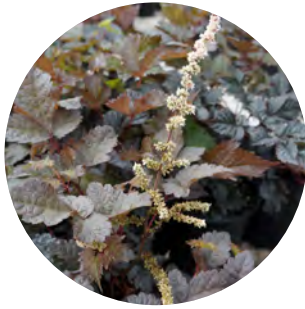
Astilbe 'Chocolate Shogun'