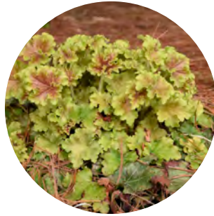
Heuchera Dolce® 'Apple Twist'

Geranium 'Biokovo', Geranium 'Ballerina'