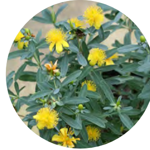
Hypericum Blues Festival®

Suggested Sub: Hydrangea Endless Summer Pop Star®