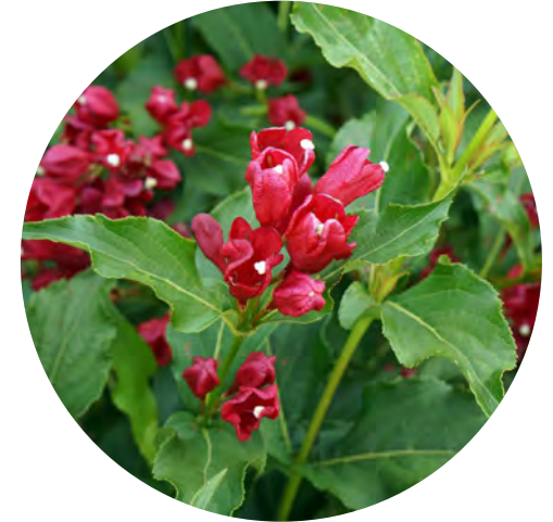
Weigela Sonic Bloom® Red