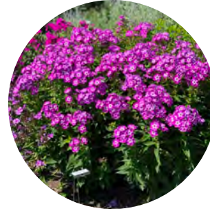
Phlox paniculata 'Laura'

Reason: Replacing with Phlox Luminary® series Suggested Sub: Phlox paniculata 'Sunset Coral'