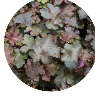
Heuchera 'Purple Petticoats'