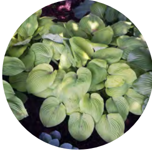
Hosta 'August Moon'