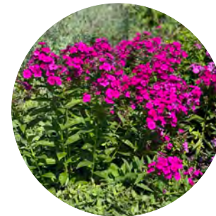
Phlox paniculata 'Nicky'

Reason: Replacing with Phlox Luminary® series Suggested Subs: Phlox paniculata 'Opalescence', Phlox paniculata Grape Lollipop™