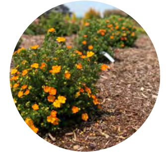
Potentilla Bella Sol®