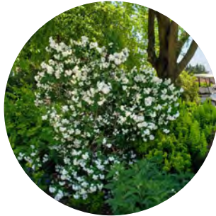
Philadelphus Snow White™