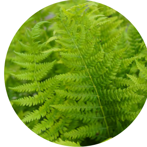
Fern, Dennstaedtia punctilobula