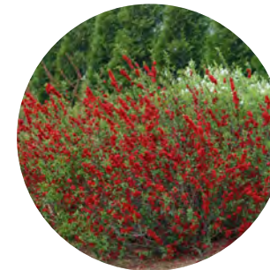
Chaenomeles Double Take® Scarlet