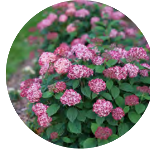
Hydrangea Invincibelle® Ruby

Reason: Did not perform as expected in the landscape