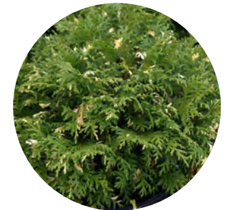
Chamaecyparis p. 'Mini Variegated'