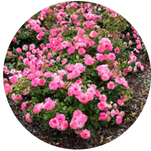
Rosa Drift® Sweet

Reason: Consolidating Drift® line Suggested Sub: Rosa Pink Drift®