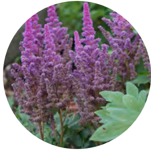
Astilbe c. 'Vision in Red'