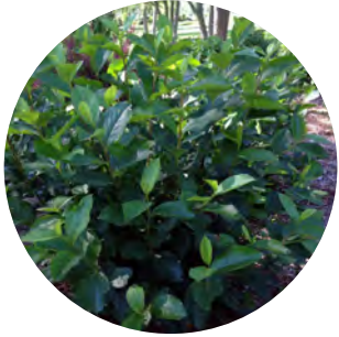
Aronia Low Scape Hedger®