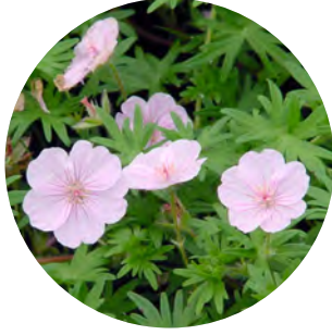
Geranium sang. striatum