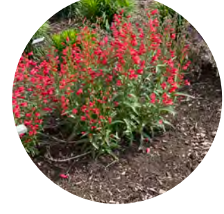
Penstemon 'Red Riding Hood'