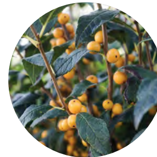
Ilex vert. Berry Heavy® Gold

Suggested Sub: Hypericum Cobalt-n- Gold™ - NEW24