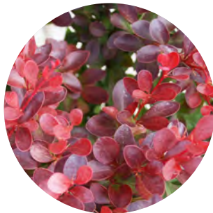
Berberis 'Atropurpurea Nana'