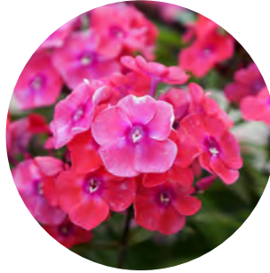
Phlox paniculata 'Glamour Girl'

Reason: Replacing with Phlox Luminary® series Suggested Sub: Phlox paniculata 'Backlight'