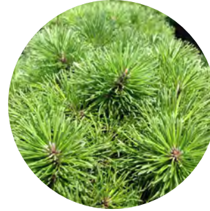
Pinus mugo 'Valley Cushion'