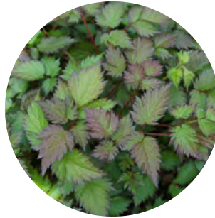
Astilbe Color Flash®