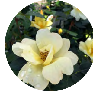
Rosa Knock Out® Sunny

Reason: Slimming Knock Out® line Suggested Subs: Rosa Ringo All-Star™, Rosa Oso Easy® Italian Ice