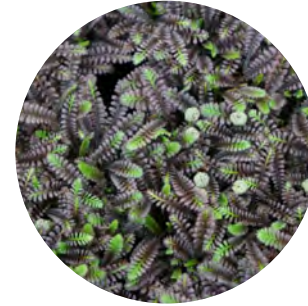
Leptinella 'Platt's Black'