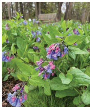
Mertensia virginica Virginia Bluebells