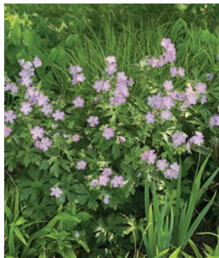
Geranium maculatum Wild Geranium