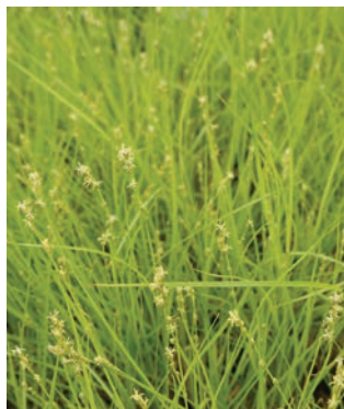
Carex radiata Straight-styled Wood Sedge