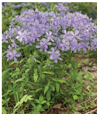
Phlox divaricata Woodland Phlox